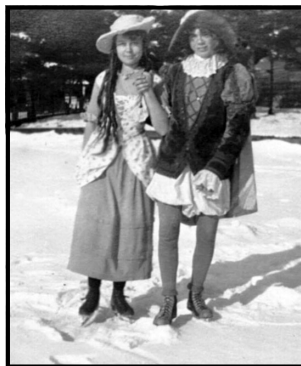
Winter Carnival about 1916

Skating was popular on frozen ponds, lakes and rivers and had, in fact, been an activity from very early times when people made primitive blades out of bones and strapped them to their feet. The local rink was a favourite gathering place. Sometimes music was played to accompany the skaters. At winter carnivals people donned costumes for