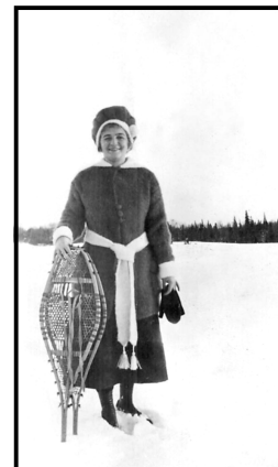
Snowshoe- ing in the early 1900's