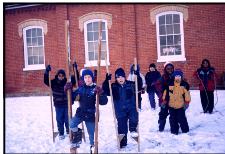
Winter Games in the Schoolyard today